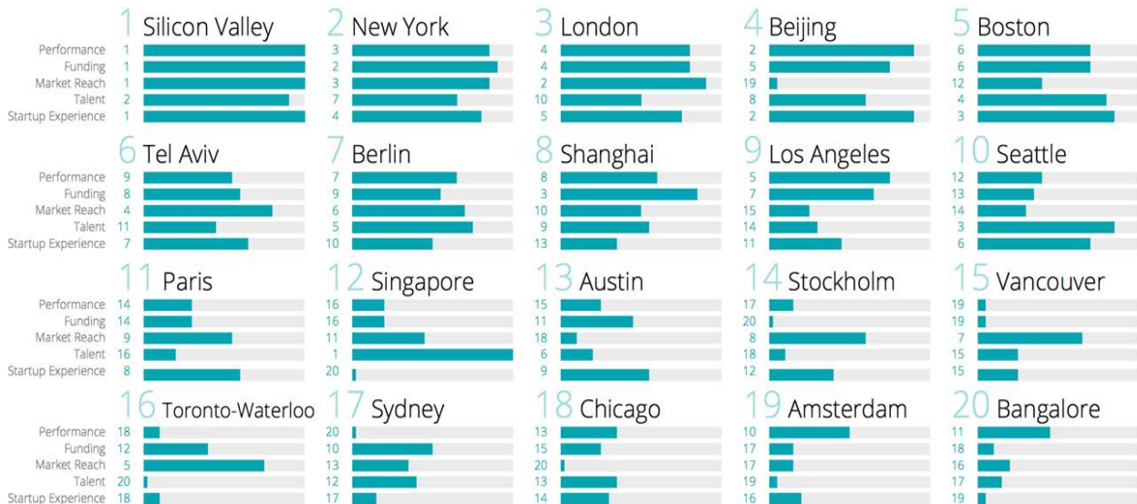
Table 2. 2017 Global Startup Ecosystem Ranking