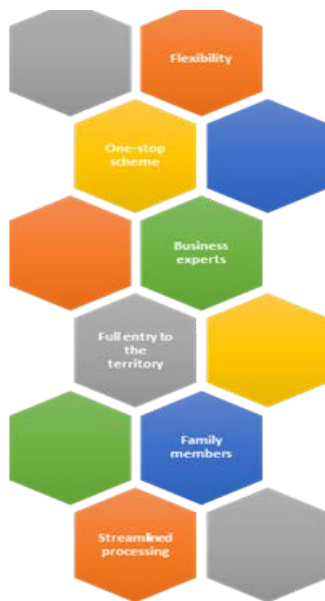
Figure 1. Key considerations of the Spanish startup scheme