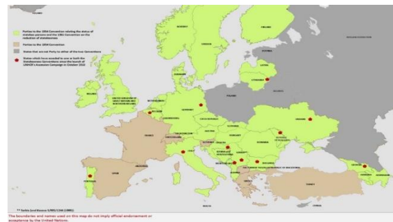
Figure 1 - States Parties to the Statelessness Conventions in Europe