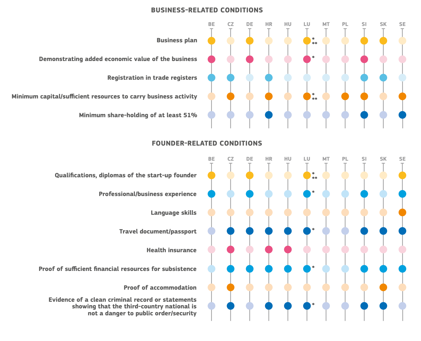
Table 6 Admission conditions in Member States without a specific scheme