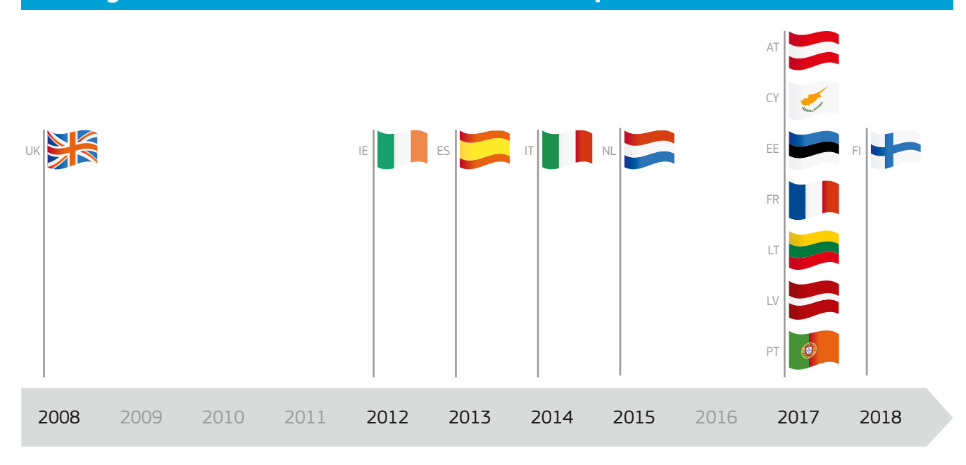
Figure 1 Timeline of introduction of start-up schemes

knowledge economy. In some countries, microeconomic changes are also at play. For example, in Finland, the business scene has undergone a historical shift from a playing field dominated by few large companies to a dynamic business ecosystem dominated by multiple small enterprises. Now, in Finland most new jobs are created by small and medium-sized enterprises, especially in technology and innovation-based growth, which account for most of the economy's productivity gains. Special schemes have also been established in Member States to better target specific groups of third-country nationals. For example, in Austria, a separate admission track for start-up founders became necessary after it was recognised that the previous provisions applying to the admission of young entrepreneurs intending to start a business were overly restrictive.