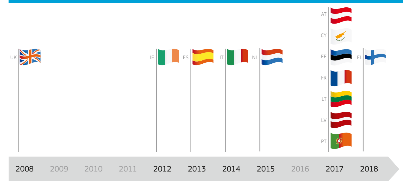
Figure 2 Timeline of introduction of start-up schemes

Attracting start-ups and innovative entrepreneurs from third countries is a policy priority in 17 Member States and is reflected in national policies, strategies and action plans. The remaining Member States have no specific policy focus on attracting entrepreneurship from third countries.