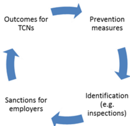
Figure 1: Illegal employment policy cycle