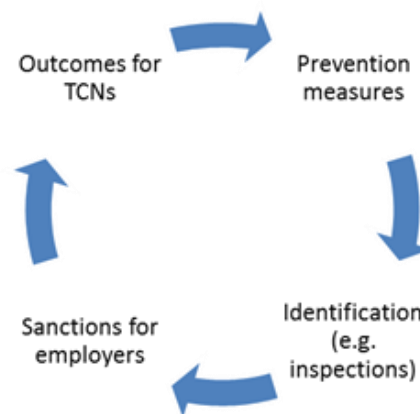
Figure 2: Illegal employment policy cycle

Figure 2 below depicts the different steps of illegal employment policy as a cycle. Firstly, the prevention measures and incentives for both employers and employees are depicted as a first step in the policy cycle. This is followed by identification of illegal employment through inspections and other measures which in turn leads to sanctions for employers and different outcomes for migrants (such as return to the country of origin or regularisation of stay and employment). It is recognised that the various steps do not necessarily follow chronologically from each other; however, the notion of a cycle is used in the Study for organisational purposes, as it helps to highlight the different aspects which the analysis will focus on.