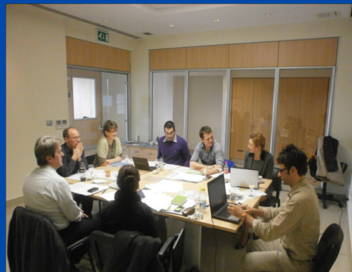
Content Expert Group on CEAS module development, January 2013

EASO is currently working on developing a new module on the Common European Asylum System (CEAS). A content group of five Member State experts from Belgium, Cyprus, Finland, Germany and Poland and an expert from the European Commission are actively working on the content of this module which aims to be ready by the end of the year. The CEAS module will be replacing the previous module Introduction to EU Asylum Law and Policy.