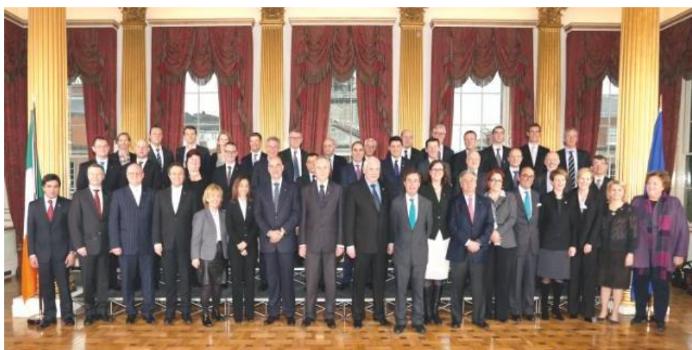
JHA Informal Council Family Photo: on 16/17 January 2013, the informal JHA Council was held in Dublin. Dr Visser participated in the Council meeting.