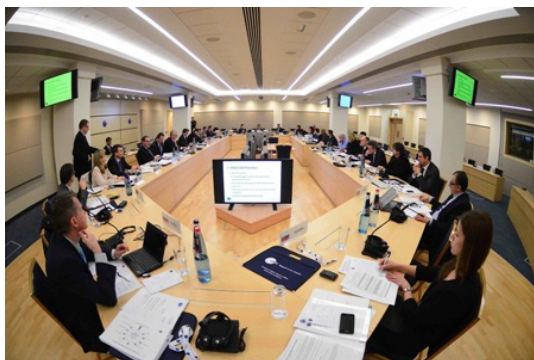
10 th EASO Management Board Meeting, 4/5 February 2013