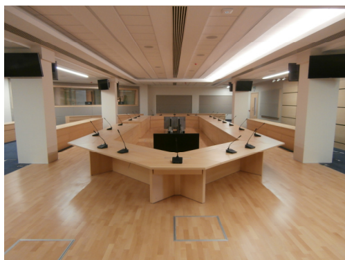
New state of the art EASO conference facilities situated in the EASO headquarters at the Valletta harbour (Malta).