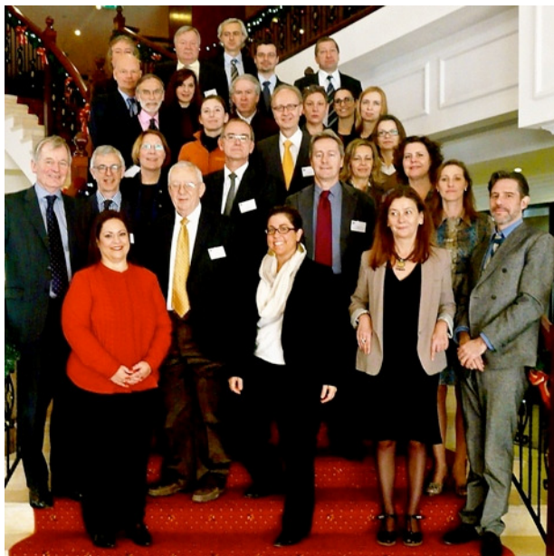
EASO's meeting with members from EU Member States courts and tribunals, 17 and 18 December 2012, Malta

On 17 and 18 December 2012, EASO met with a wide and experienced representation from Member States' courts and tribunals dealing with asylum matters.