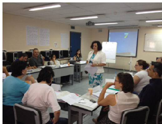
EASO training in Greece

Training and quality: In 2013 EASO Training modules and materials will be updated to reflect the developments in the new asylum acquis and new ones will be developed. EASO will hold 13 to 14 train-the trainer sessions and train some 160 participants. EASO has started a Quality mapping exercise to obtain comprehensive information about the situation 'on the ground' and facilitate exchange of information, expertise and good practices in the implementation of the CEAS.