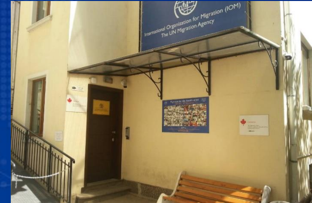
IOM office Sofia