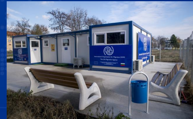
IOM sub office Harmanli reception center