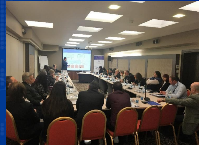
Site Management training, March 2018, Sofia

“Strengthening collaboration, sharing experience and exchange of good practices” between State Agency for Refugees, Ministry of Interior of the Republic of Bulgaria, Migration Directorate at the Ministry of Interior and IOM Bulgaria/ HQ /RO Brussels